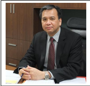
Message from the President